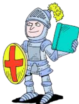
You can't fight with the Word until you know the Word

The sword of the Spirit, which is the word of God must be "at hand"—that is, you need to read it and study it and know what it says, so you can use it to counter what the devil, the world, and your own desires are telling you. I have heard so many people misquote the Bible over the years—I have probably done it myself more than once. Do as Jesus did (Matthew 4:1-11), parrying falsehood and